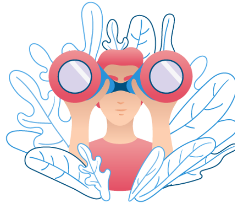
Public Procurement Oversight